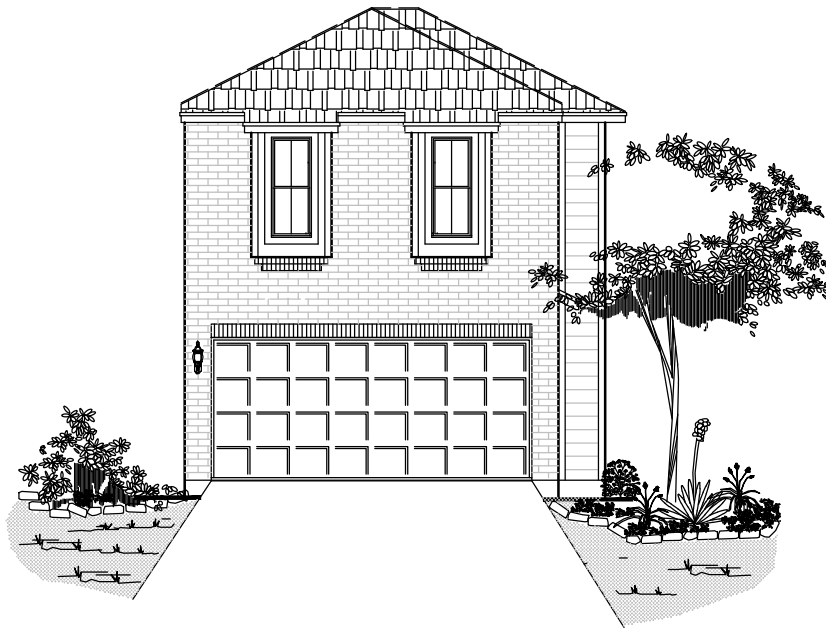
FRONT ELEVATION "A" Plan CH-1800